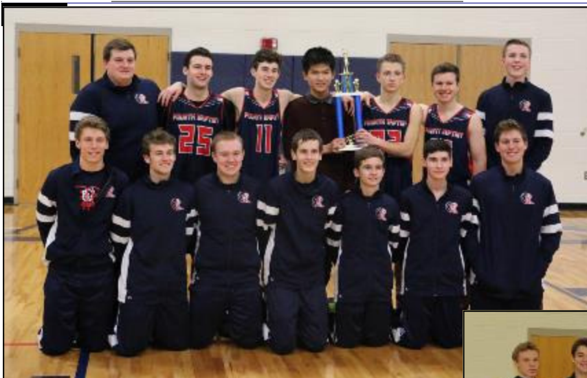
MACS Basketball Champions: Fourth Baptist Warriors