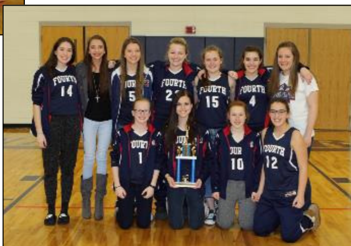
MACS Basketball 2nd place: Fourth Baptist Lady Warriors