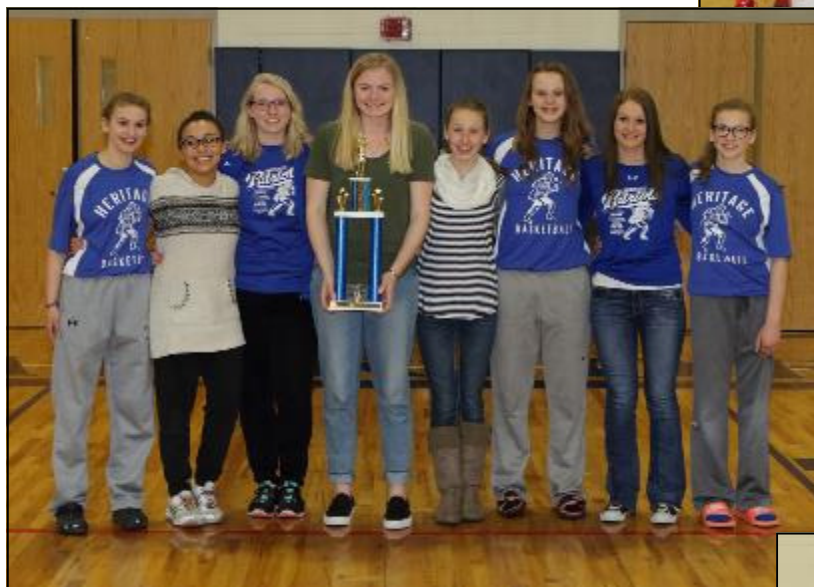
MACS Basketball Champions: Heritage Christian Lady Patriots