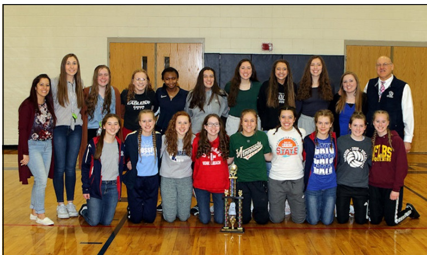
Girls Champions: Fourth Baptist Lady Warriors