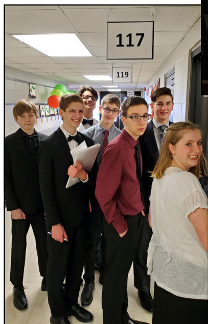
Students eagerly wait to enter a performance room.