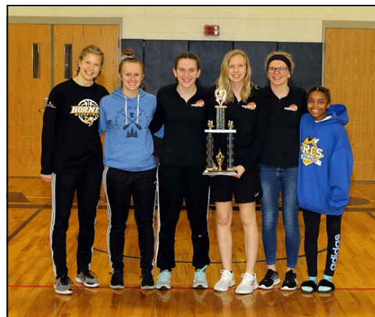
Girls 2nd Place: Lake Region Lady Hornets