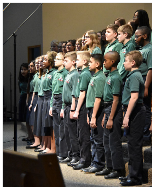
Members of the First Baptist School choir get ready to sing their song for the JH MACS Fine Arts Festival.