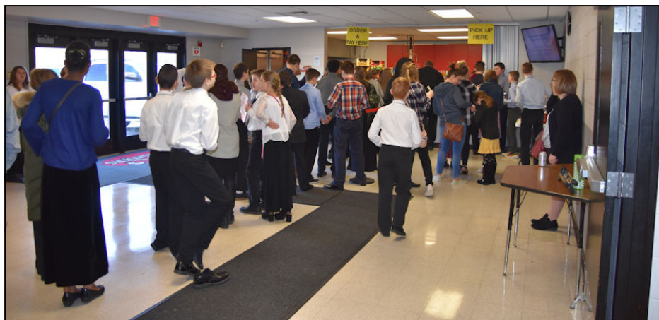
It's lunch time at the JH MACS Fine Arts Festival. Young people line up for the most favorite time of the day.