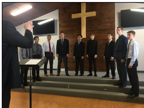
The Fourth Baptist 8th Grade Men's Ensemble performs in the Johnson Chapel. It is wonderful to hear our young men singing praise to the Lord. They received an excellent rating.