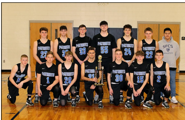
Boys Champions: St. Francis Patriots