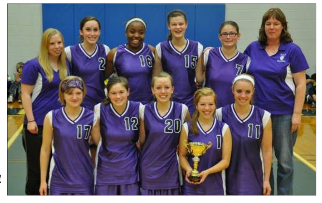
"Whether, therefore, ye eat or drink, or whatsoever ye do, do all to the glory of God." - I Corinthians 10:31

Owatonna Christian Girls Volleyball Team on their MACS Championships!