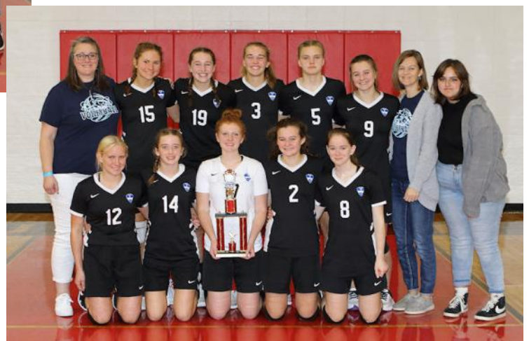
Below: Rosemount Lady Crusaders—2nd place