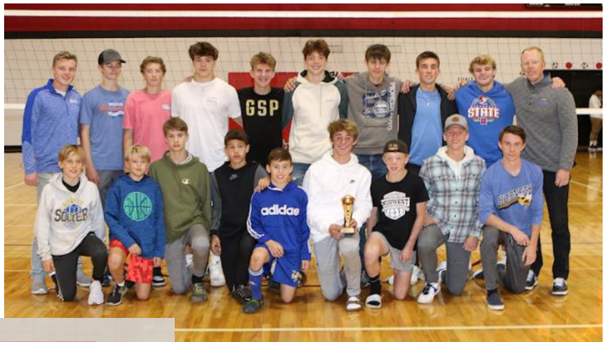
Below: Lake Region Hornets—2nd place