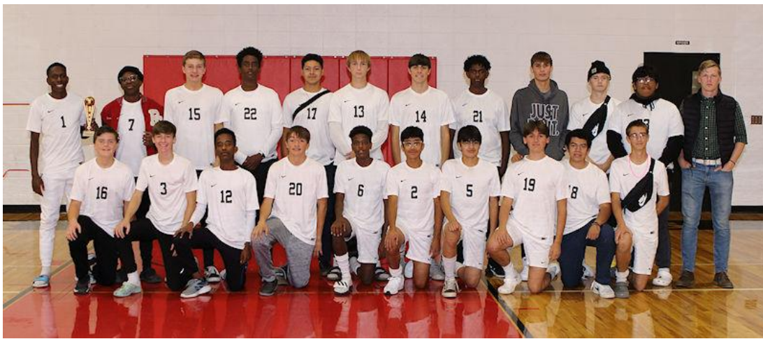
Above: Rosemount Crusaders—Soccer Champions