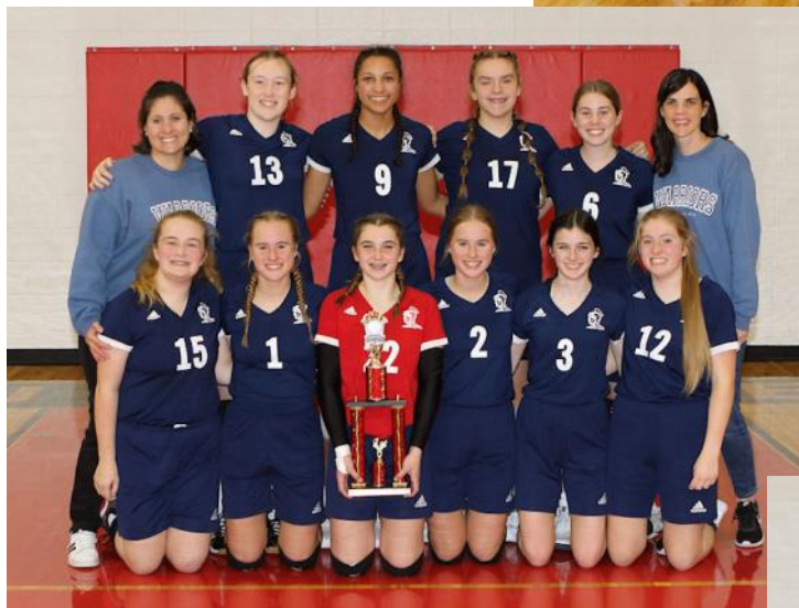
Left: Fourth Baptist Lady Warriors—Volleyball Champions