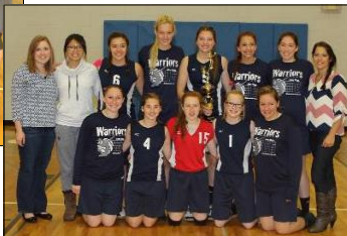
MACS Volleyball 2nd place: Fourth Baptist Christian School Lady Warriors