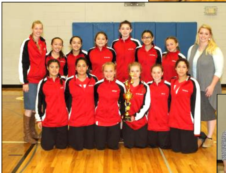
MACS Volleyball Champions : First Baptist School—Rosemount Lady Crusaders