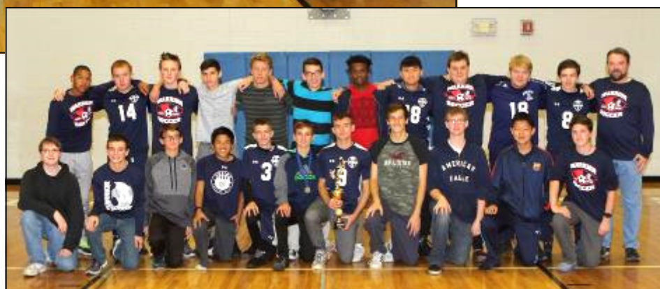
MACS Soccer 2nd place: Fourth Baptist Christian School Warriors