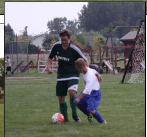
At left: Valley Christian, First place in Soccer