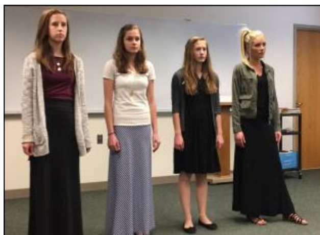
The Ladies' Quartet from Owatonna Christian School