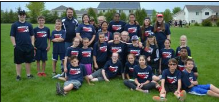
Fourth Baptist Track Team