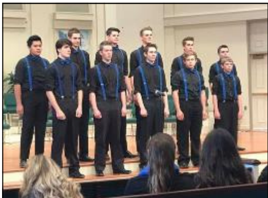
The St. Francis Men's Ensemble