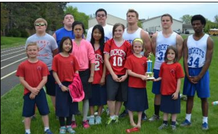
Granite City Track Team