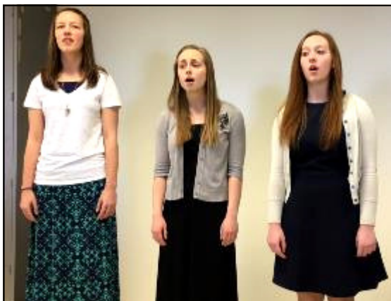
The Owatonna Ladies' Trio