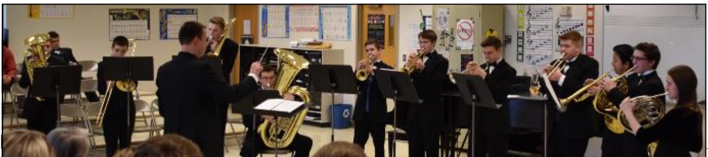
The Fourth Baptist Brass Ensemble