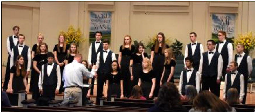
The Chisago Lakes Choral Group