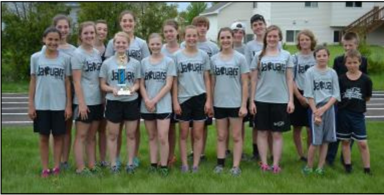
Valley Christian, WI Track Team