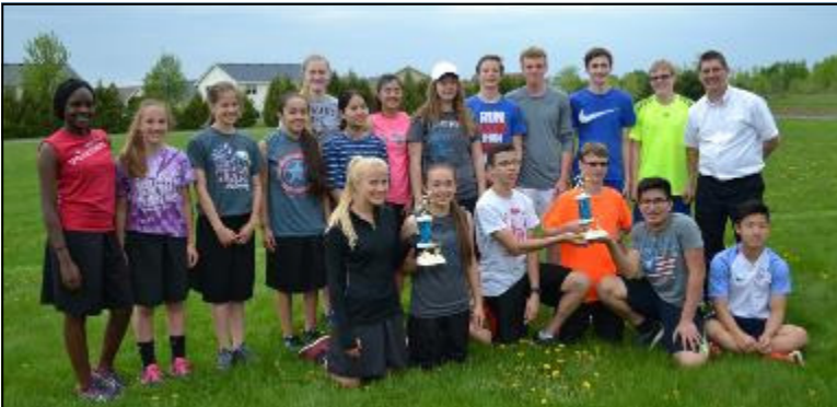
First Baptist, Rosemount Track Team