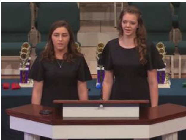
The Ladies' Duet from Woodcrest performing "Will There Really Be a Morning?" during the Awards Ceremony