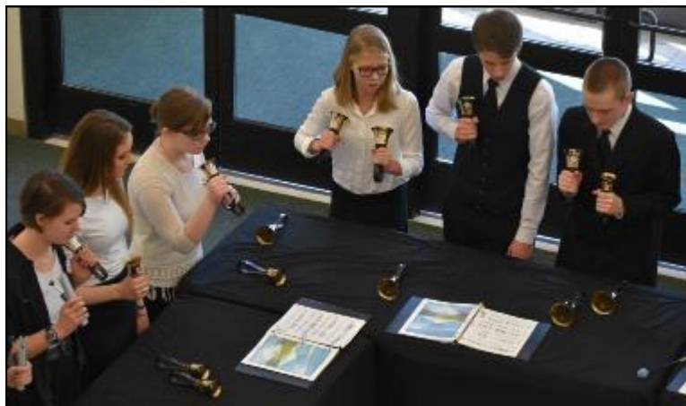
The LRCS Handbell Choir