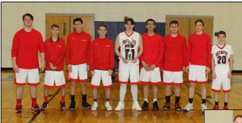
MACS Basketball 2nd Place: First Baptist, Rosemount Crusaders