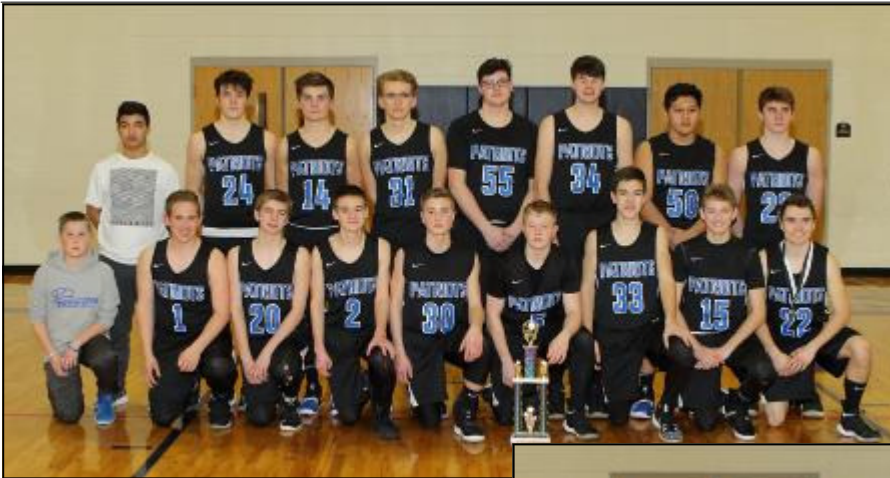
MACS Basketball Boys Champions: St. Francis Patriots