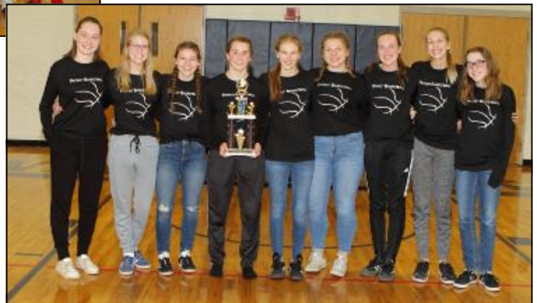
MACS Basketball 2nd place: Chisago Lakes Lady Patriots