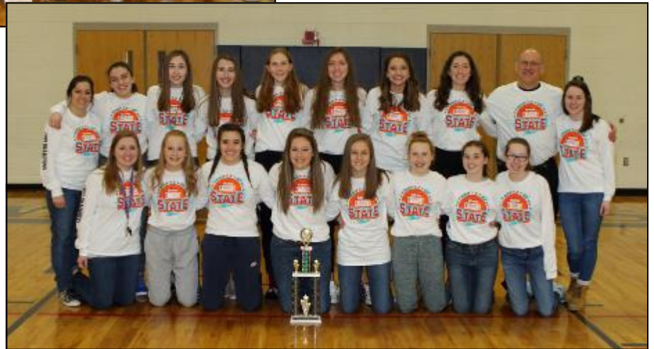
MACS Basketball Girls Champions: Fourth Baptist Lady Warriors