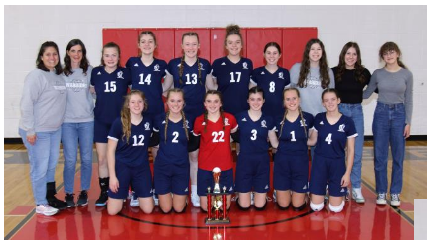
Above: Fourth Baptist Lady Warriors—Volleyball Champions at Right: St. Francis Lady Patriots—2nd place