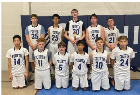
Fourth Baptist JV Boys