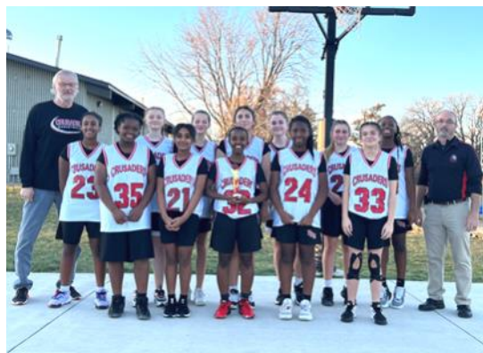
First Baptist JV Girls