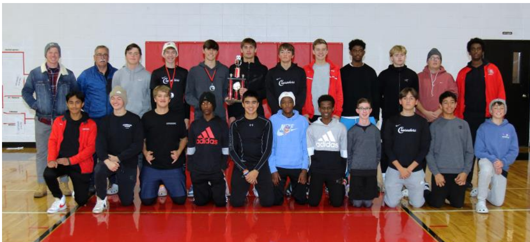
Rosemount Crusaders— Soccer Champions