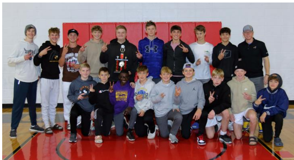
Lake Region Hornets— 2nd place