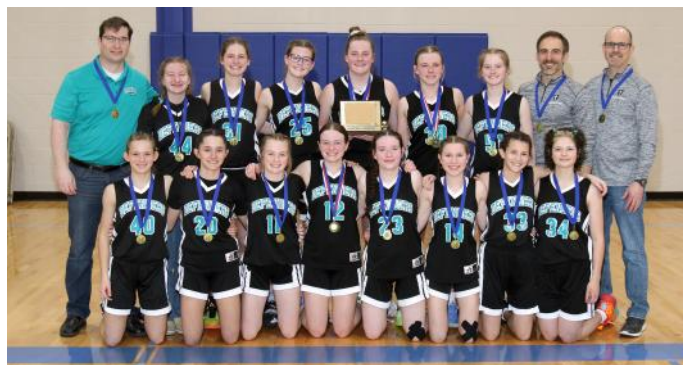
Rochester Homeschool Defenders

Third Place: Fourth Baptist Christian Warriors