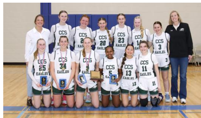
Community Christian Eagles