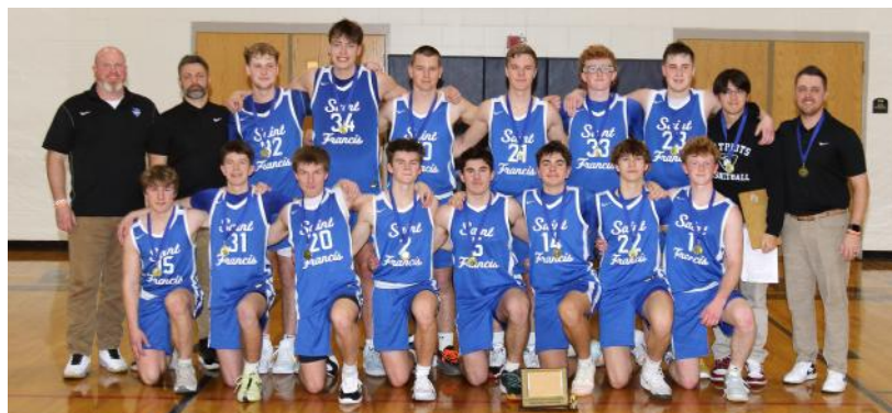
St. Francis Patriots