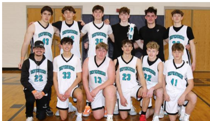
Rochester Homeschool Defenders